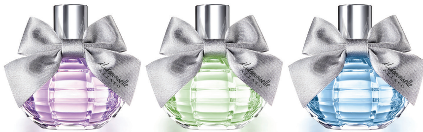
L'EAU TRÈS BELLE